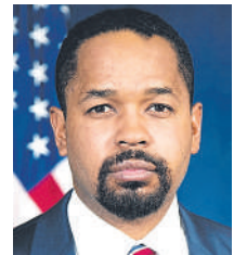
Sharif Street State Senator